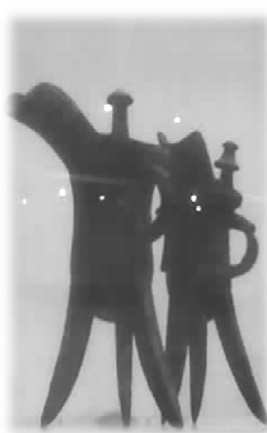
Jue wine goblets circa Eastern Zhou Dynasty, on display at the Royal Ontario Museum, Toronto, Canada.

Players of this version can attempt some contrast in the theme by accentuating the ‘imperfect’ phrase endings, as well as the whole harmonic section at the end of the piece, absent in other manuscripts and versions.